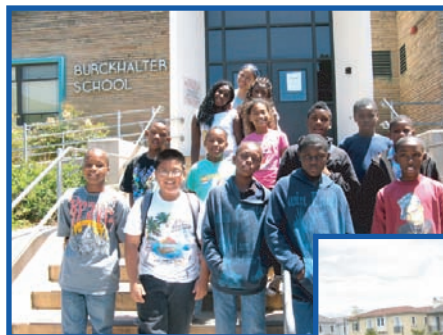
Burckhalter & Laurel students head off to camp