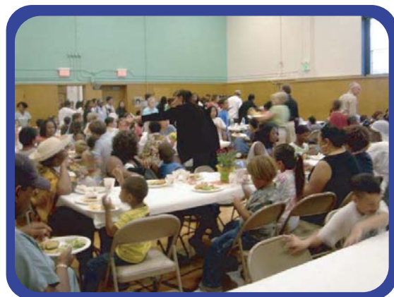
Back to School Night at Burckhalter Elem.