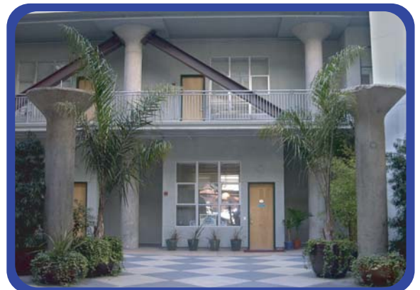
The atrium of Telegraph Lofts. This is the new home of Faith Network's office, 2633 Telegraph Ave. #409, Oakland, 94612.

It's official! Faith Network has an office of its own. We are now proud tenants of the newly remodeled Telegraph Lofts (formerly the Sears Roebuck and Company) in Oakland. God has been faithful in providing for us and allowing us to spread our wings. Please note our new address. Correspondance can be sent to our old address during this transition.