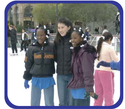
Sisters from Fruitvale Elementary pose for a picture with Kristi Yamaguchi

Children from around the Bay Area anxiously laced up their skates, some for the first time, in anticipation of getting on the ice with Olympic gold medalist Kristi Yamaguchi. On December 10th, children from Today's Youth Matter (TYM) and Faith Network were invited to San Francisco to get ice skating lessons and skate with Kristi Yamaguchi. After a fun filled time on the ice, lunch was provided followed by a visit from Santa. Each child received two gifts and a picture with Kristi. This special occasion was a joint collaboration between the Always Dream Foundation and The Family Giving Tree.